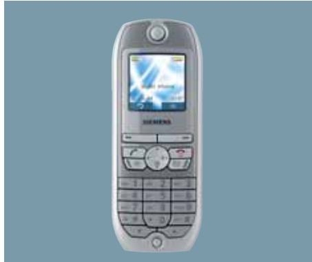
optiPoint WL2 professional

Telephony via PC offers many advantages: no telephone takes up space on your desk; you can work anywhere – whether you are in the office or on the road - with the same familiar user interface.